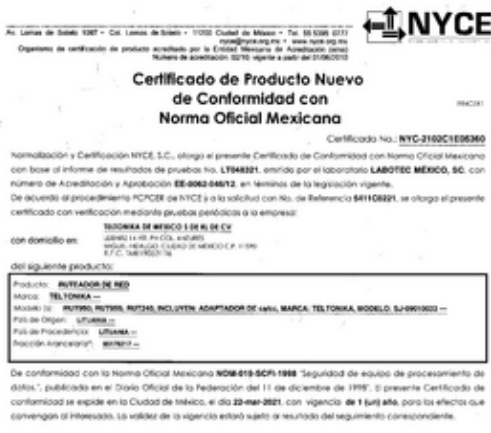
NOM Safety Certificate