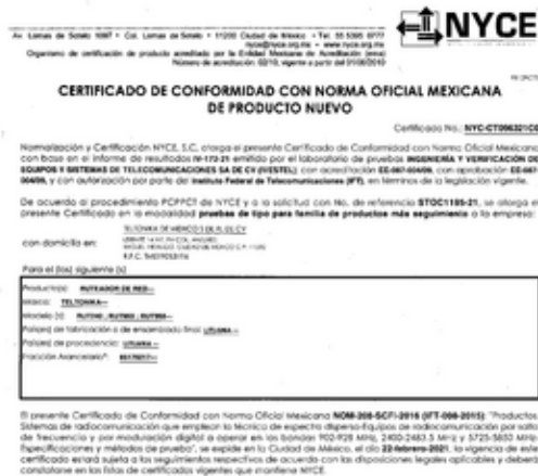
NOM Wireless Certificate